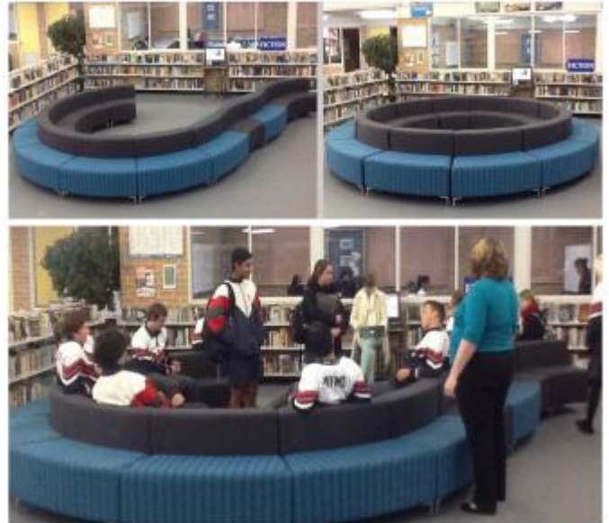
A new modular furniture piece has arrived at Nirimba Library as part of the new "Campfire" collection, accommodating flexibility to facilitate and encourage varied teaching and learning styles.