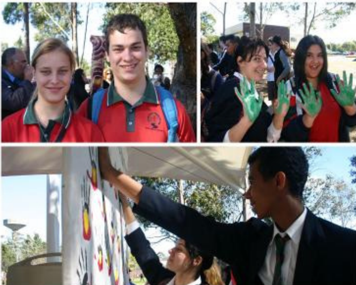
Students from the Nirimba Campus took part in the Aboriginal and Torres Strait Islander Reconciliation Ceremony within the Nirimba Precinct last Wednesday, proudly representing the College and their culture.