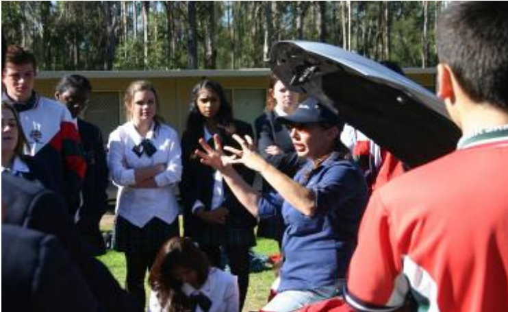
Year 11 students have been learning to become road ready by taking part in a car maintenance workshop within their Learning Enrichment Program.