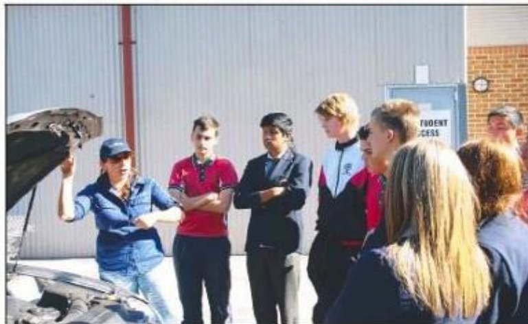
Year 11 students from Terra Sancta College took part in a car maintenance workshop.